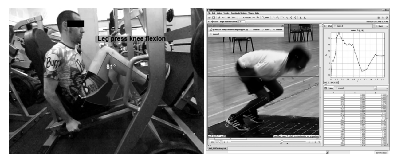
Figure 3. Angle measurements with Kinovea and Tracker.

for video capture and analysis. Beyond all the features mentioned above, the software includes an interesting function called 'stromotion' that marks and fixes certain key frames on the image to track certain key points of the movement. Dartfish<sup>™</sup> also permits users to insert a video into another video in function the called 'simulcam' with the objective of comparing two different executions of the same movement (Figure 3). It is certainly useful in case of model comparisons. Angle tracking is a quite common function of this type of software, and also Kinovea and Tracker allow for the tracking of angles of certain movements around a joint and the detection of angle variations during a movement (Figure 3). But the traditional performance analysis system is Ariel© by APAS™, which was the first computerized movement analysis system available. Now, the system includes software for a set of two or more high-speed cameras in a complete movement analysis system. Like other systems, Ariel permits complete 3D analysis with video modelling and collects data about position, speed and acceleration of every part of the body in a given movement. The software also permits users to digitalize movements to create models and identify the vectors of the forces exerted by the athlete. Moreover, the system offers the possibility to track movement by measuring the position from the suit with markers at the key points of the body. The solution plots all the data in real time and synchs