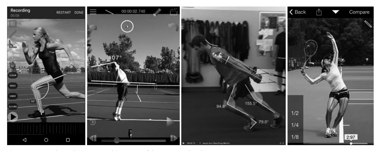
Figure 5. Screenshots of CMV+, Coach's Eye, Dartfish Express and Technique.

All biomechanics studies use the video cameras with high sampling frequency, which can be found in most laboratories. In addition to this research, there have been some interesting studies using high-speed video cameras with simple motion analysis, as practitioners might do in the field. This is precisely the sort of research we want to discuss in this paper, and in so doing we want to give some practical ideas coaches and athletes will be able to apply in their daily work. One of the first focuses of interest in using the high-speed cameras was the assessment of the ground contact times in running and sprinting activities. Knowing the reactive ability of the athletes when contacting the ground constitutes an interesting indicator of sprinting performance. Rimmer and Sleivert (Rimmer & Sleivert, 2000) investigated the effect of conditioning training pro-