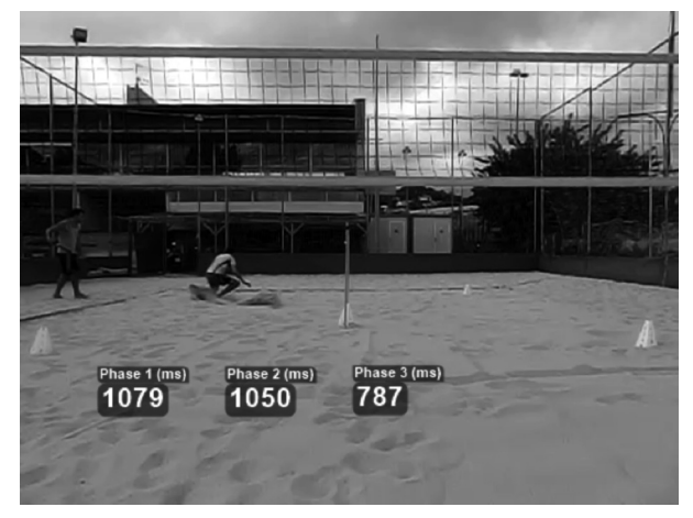
Figure 7. Agility timer application with Kinovea.

athlete over a given distance and report information about speed and acceleration.