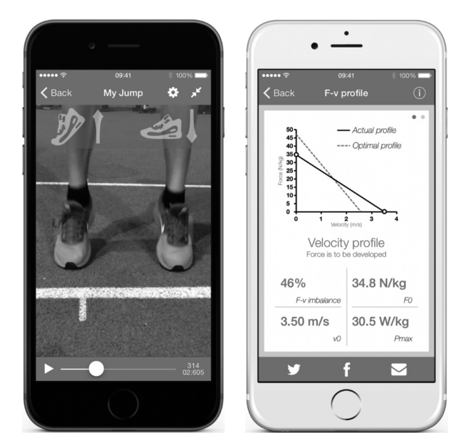
Figure 6. Screenshots of MyJump mobile app.

new generation of high-speed cameras of smartphones (Balsalobre-Fernández, Glaister, & Lockey, 2015). Determining the moments the feet take off and land, the app calculates the flight time and the jump height using the equation described in the literature (Bosco, Luhtanen, & Komi, 1983). The method used by the app was found to be valid and reliable against a force platform-based method (Balsalobre-Fernández et al., 2015) (Figure 6). A Casio® ZR1000 HS EXILIM camera has also been used for the same objective, to measure flight time, in this case of beach volleyball players on sand (Buscà et al., 2015). Acceptable validity and reliability data were reported even considering the fact that the contact moments took place on sand. Kinovea analysis software was used to calculate the flight time and draw the criterion points. Recently, another mobile phone app called JumpPower<sup>™</sup> has been created to provide height, force and power data on jumps. This app works by automatically tracking the trajectory of the face throughout the impulse and flight phases.