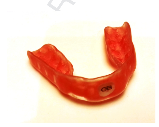
Fig. 1. Type of mouthguard used for the study.

140 Anaerobic power and capacity were assessed using the 30-s WAnT with and without mouthguard (MOUTHG and NO-MOUTHG, respectively). Subjects completed a 30-s maximal effort on an electronically braked cycle ergometer Lode Excal-141 ibur Sport V2.0 (Lode Medical Technology, Groningen, The Netherlands) at a resistance equivalent to 7.5% of their body mass. 142 The ergometer was interfaced with a computer loaded with software (Wingate Software Version 1.11, Lode BV) that applied 143 the appropriate load for each subject. As a warm-up procedure, subjects were instructed to begin pedaling for 5 min at 144 100 W and approximately 60 rpm. After a 5 s countdown and without altering the mentioned parameters, subjects were 145 asked to begin pedaling as fast as possible while receiving verbal encouragement throughout the test. Peak power, mean 146 power, minimum power, time to peak power, relative peak power, relative mean power (W) and fatigue index (W s<sup>-1</sup>) were 147 calculated and recorded in an online data acquisition system. The rate of perceived exertion (RPE) was collected after each 148 149 trial using a modified 10-point Rating of Perceived Exertion Scale (CR-10:RPE) (Borg, Hassmén, & Lagerström, 1987). Capil-150 lary blood samples were taken on right fingertips at the third minute after completion of the test and analyzed for lactate concentration by using the Lactate Pro (LT-1710, Arkray, Japan) portable analyzer. 151