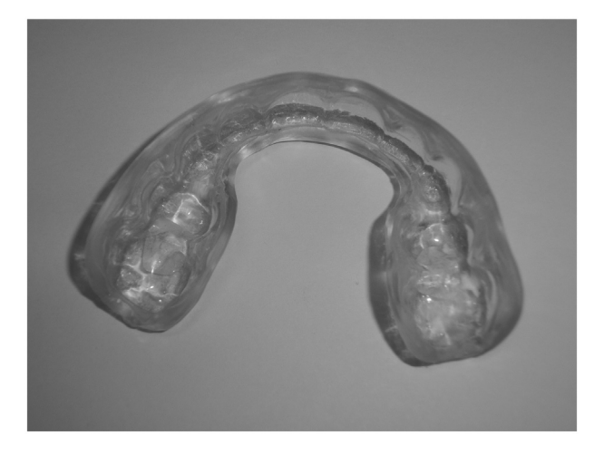
Fig. 1. Mouthguard used in this study.

Participants performed a specific warm-up with a free load bench press and a leg press machine (Technogym, S.p.A. Inc., Gambettola, Italy). Researchers asked the subjects to perform two maximal power repetitions with 30, 40, 50 and 60 kg in the bench press (BP30, BP40, BP50 and BP60 respectively) and with 190, 220, 235 and 250 kg in the leg press (LP190, LP220, LP235 and LP250 respectively). The loads described were usually used in team's strength training sessions during the in-season period and could be lifted by all the subjects being all below 80% individual 1RM, and could be lifted at least six times per set at the moment of the tests.