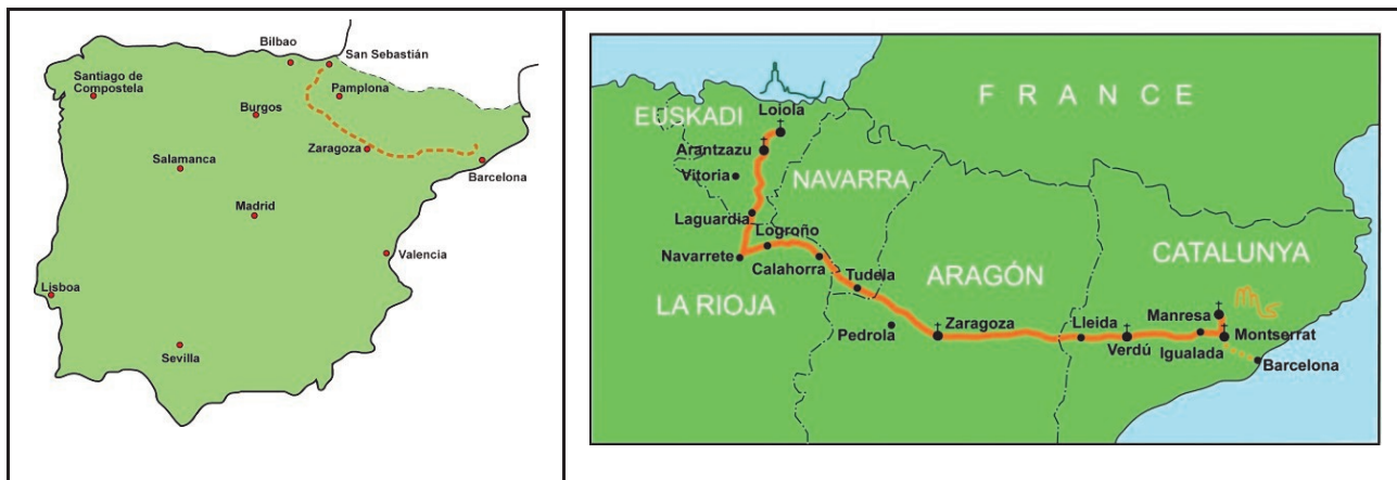
Fig. 2. Ignatian Way