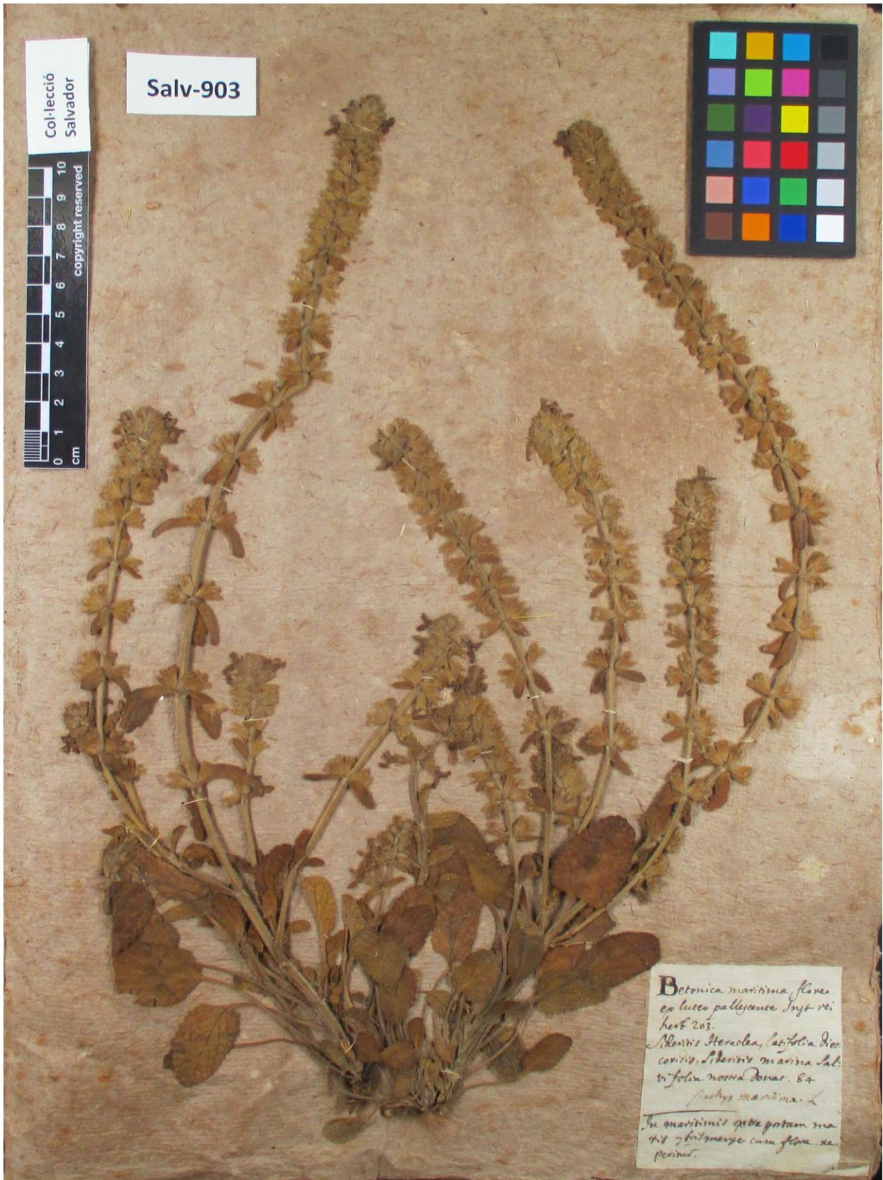
Fig. 1 Specimen of Stachys maritima Gouan from Portal del Mar, Barcelona, 18th century (BC-Salv-903), testimony of its presence in Barcelona's littoral, where it has disappeared