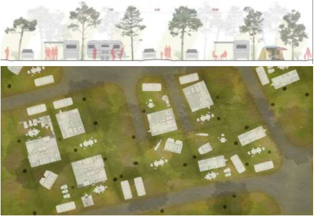
Figure 15. Private Plots and Informal Occupation, El Toro Bravo

regular height of trees generated a virtual natural ceiling that let circulation of fresh air and also framed sea views. Its density as well as its shadow enabled the architects to place lodgings in all different orientations so that footprint distributions were easier to follow than it seemed because of the different shapes and dimensions of plots (Figure 15).