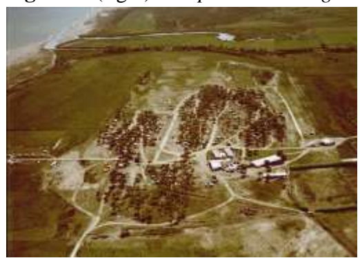
Figure 4. (left) Campsite El Delfin Verde, 1963 Figure 5. (right) Campsite Cala Gogó – El Prat, 1975

promoted foreign tourism as a driving force for change. So, Spain began to open its doors to foreigners in terms of cultural, social and economic values. These sociopolitical conditions have been proven crucial for the establishment of coastal campsites as massive leisure destinations, evolving from the previous facilities for spending the night in nature, such as hiking camps and beach baths (Figure 4).