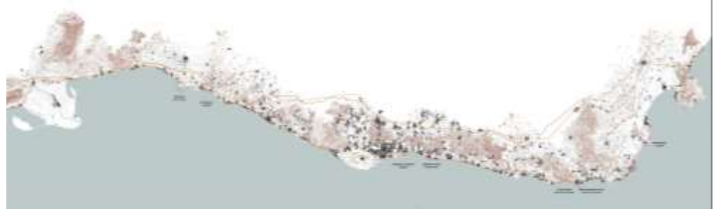
Figure 1. Typological Map of Catalan Coast