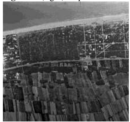
Figure 7. (left) Pine Forest in Llobregat, 1992 Figure 8. (right) Sloped Lands in Calonge, 1961

On the one hand, the location of El Toro Bravo was defined by a fragile context of beaches, dunes, pine forests and water (Figure 7). All of these were dynamic and easily modifiable elements. Thus, under those pine forests, the perks of shaded areas and flat plots were directly available. On the other hand, the location of Cala Gogó was defined by a tectonic landscape. Its high topography and lack of vegetation, due to previous agricultural usage, did not easily enable the construction of a new settlement of this kind (Figure 8). In this case, the architects modified its topography following local systems of adaption, and also added some formal elements to provide enough shade.