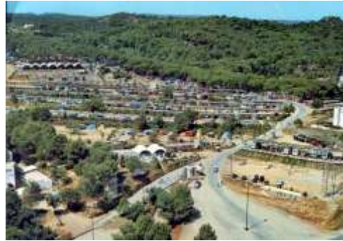
Figure 10. General View and Composition, Cala Gogó, Calonge

In the case of Cala Gogó, the high topography established horizontal platforms which followed level curves. Thus, the shape of the settlement was defined by a pattern which was perpendicular to its slope and provided sights over the sea. Its limits were defined by the two existing streams that descended onto the beach. In the center of the settlement a singular building was placed that hosted the provision of all common services in a unique way. This central area gradually became a public square that fixed a clear landmark capable to colonize landscape (Figure 10).