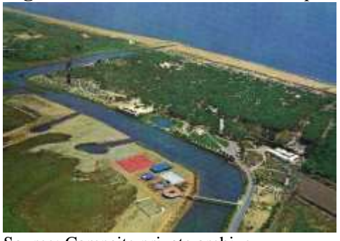
Figure 9. General View and Composition, El Toro Bravo, Viladecans