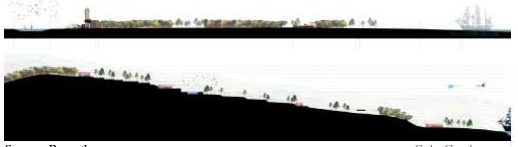
Figure 6. Comparison Between Landscapes, Case Studies El Toro Bravo

This analysis focuses on two representative examples of this duality, being located to landscapes standing opposite to each other (Figure 6). On one hand, the "El Toro Bravo" campsite (Architect F. Mitjans 1962, Barcelona) was located on a flat land close to the sea and under a pine forest. On the other hand, the "Cala Gogó" campsite (Architects A. Bonet and J. Puig 1961, Girona) is still located on a sloped hill towards the sea.