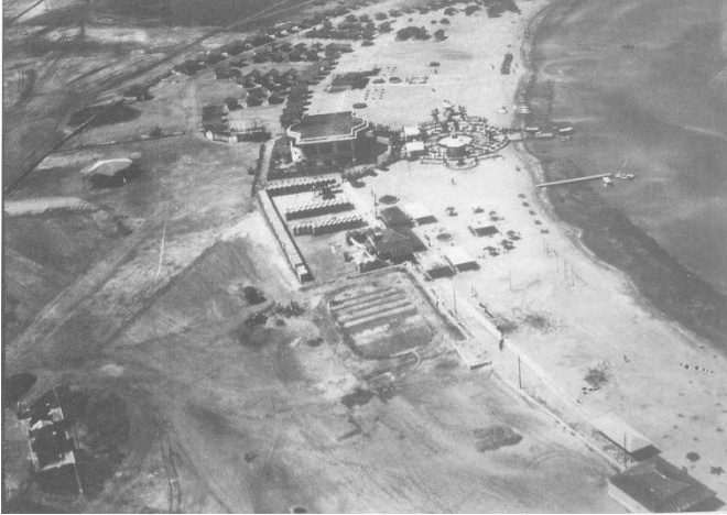
Figure 3. The Bathing Facilities of Glyfada in 1930

After the Second World War, Glyfada enjoyed an equivalent popularity as a tourist resort. The turning point in this trend took place about the middle of the 1980 decade when different factors of negative environmental impact and its accumulative effects on a regional scale contributed to deteriorated the ensemble of Glyfada's natural resources. At the same time, the arising of new tourist destination competitors both on a national and international level determined a spatial redistribution of tourist flows limiting thus Glyfada's competitiveness as a tourist destination.